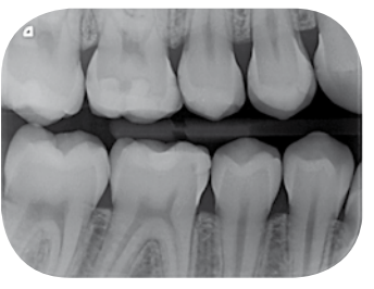
High-resolution posterior bite wing images for perfect diagnostics

The effective image resolution of X-ray systems in comparison: The VistaScan systems from Dürr Dental achieve the highest resolution compared with the competition. Latest studies show that image plate technology is the only sure way to uncompromised digitisation.