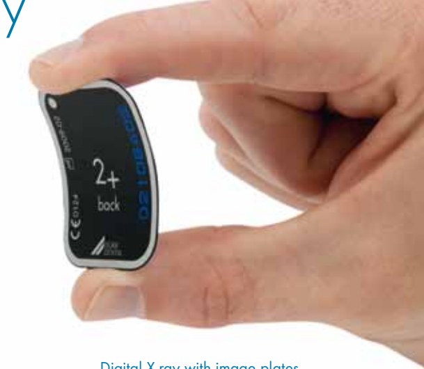
Digital X-ray with image plates the flexible solution