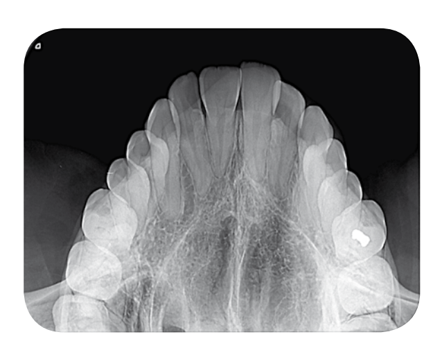
Occlusal images for diagnosis of jaw fractures, impacted teeth, cysts and ulcers

With a detail recognition of 22 lp/mm, VistaScan image plates have a higher resolution than chemical film and exceed that of any competitors. The Photon Collecting System (PCS) from Dürr Dental is already ahead of current development of image plates. Even today, the VistaScan Mini Plus is already equipped for a theoretical resolution of 40 lp/mm. That means: In diagnostics you are well-prepared for the future with this compact solution. The DBSWIN imaging software displays the results in brilliant quality and allows ergonomic working procedures. The VistaScan Mini Plus can be operated with most standard dental imaging software packages.